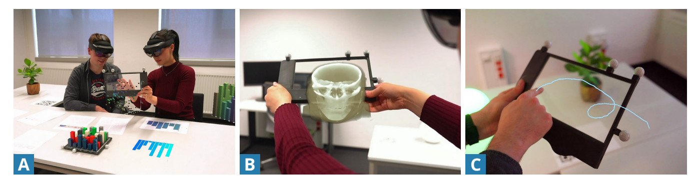
Figure 1: We demonstrate the CleAR Sight research platform. It allows multiple people to use a touch-enabled, transparent interaction panel to perform tasks such as working with abstract data visualizations (A), exploring volumetric data sets (B), and making in-situ annotations (C). All photos in this work were shot with an externally tracked camera and do not fully reproduce the actual prototype.

Raimund Dachselt<sup>†</sup> Interactive Media Lab Dresden, Technische Universität Dresden Dresden, Germany dachselt@acm.org