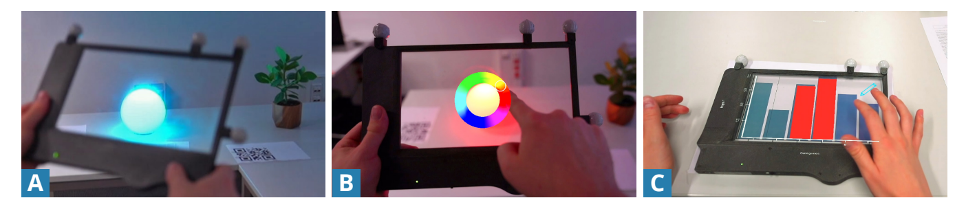
Figure 5: CleAR Sight allows configuring smart devices such as smart bulbs (A) and directly seeing the effects, e.g., color changes (B). We can show interactive 2D content on the panel. For example, when used as an overlay, the tablet allows selection in printed charts; selected data points are highlighted (C).

Figure 4: In addition to in-situ annotations (see Figure 1, C), we support on-tablet annotations that can be placed in space or allow users to annotate documents by placing the tablet on top of them (A). In addition, projected annotations allow users to annotate surfaces from a distance (B, C).