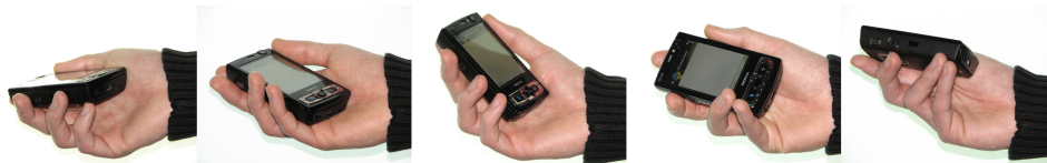
Figure 1: Tilting along the x axis: down , neutral , up and along the y axis: left , right .

We identify the following basic set of interactions: up , down , left , and right movements of either a cursor position, some widget highlight (such as in menus), or a direct mapping to navigate a movable application space (e.g. maps). These four movements can either be discrete (stepwise) or continuous (fluent) . For the latter we distinguish between a linear and non-linear mapping of the movement to the resulting interface changes.