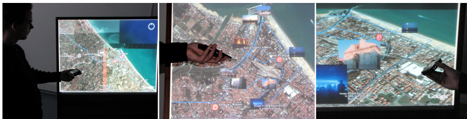
Figure 4: Remotely operating Google Earth with a mobile phone | zooming in | tilting the surface.

Google Earth COM API. With it, one can remotely operate the Google Earth interface and perform the interactions depicted in Figure 4: Panning of the map is simply performed by a continuous tilt interaction of the handheld device in the corresponding direction. To facilitate the various interaction modes provided with 3D map programs, mode switches are required. Pressing the central button on the phone, users can switch between pan mode and zoom and tilt mode . In the latter, zooming in is performed in a continuous way by moving down the phone (see Figure 4, center), zooming out by tilting it in the opposite direction. Changing bird's eye view to street view, i.e. tilting the map, is achieved by tilting the phone to the left or right, which becomes more natural when rotating the phone about 90° to a position as shown in Figure 4 on the right.