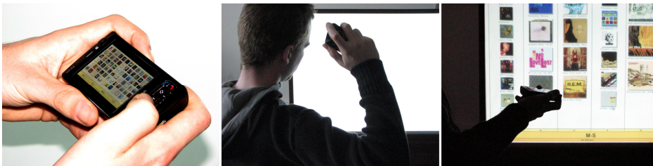
Figure 3: Operating Mambo on a handheld device | throwing it to a distant display | using tilt gestures to operate the interface on a large screen.

The zoomable music browser MAMBO: This music browser, available on mobile and other devices, supports visual browsing and faceted filtering of songs, albums, or artists according to different hierarchical metadata facets [DF07]. Thus, scrolling long lists of items is entirely eliminated. The stepwise navigation through and within levels of a facet hierarchy is achieved by discrete directional tilt gestures (left and right for panning, up and down for zooming in or out). Figure 3 (left) displays the Mambo UI on a handheld device 2 being used with tilt gestures. After throwing the interface to the distant display as shown in the middle, Mambo can be remotely operated as depicted on the right.