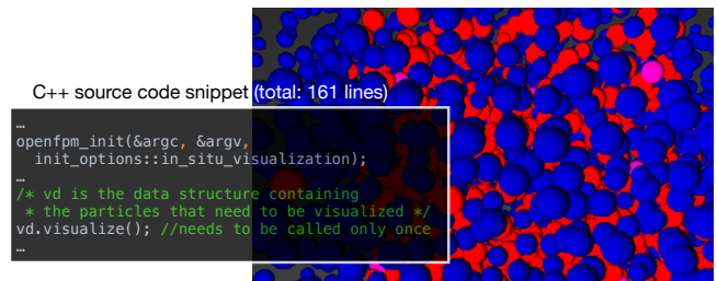
Figure 2: An OpenFPM-based distributed Molecular Dynamics simulation visualized in situ using our prototype, and the lines of code that needed to be changed to enable in situ visualization. Particles are colored by velocity magnitude.

We have presented a framework architecture for interactive VR in situ visualization of parallel numerical simulations. We used